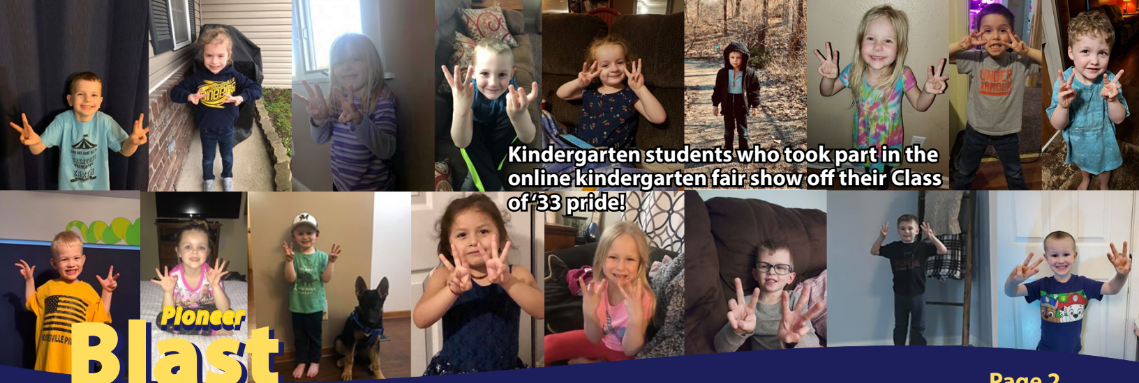
Kindergarten students who took part in the online kindergarten fair show off their Class of '33 pride!