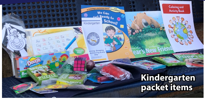
Kindergarten packet items

The event will include fun and learning packets for each kindergarten student, basic school information, frozen treats for family members, and a chance for families to ask staff members questions about kindergarten.