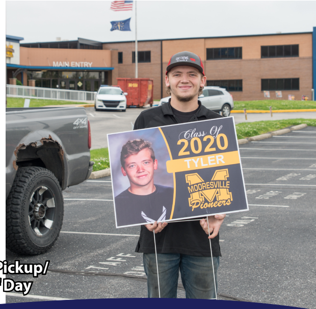
Senior Pickup/ Dropoff Day