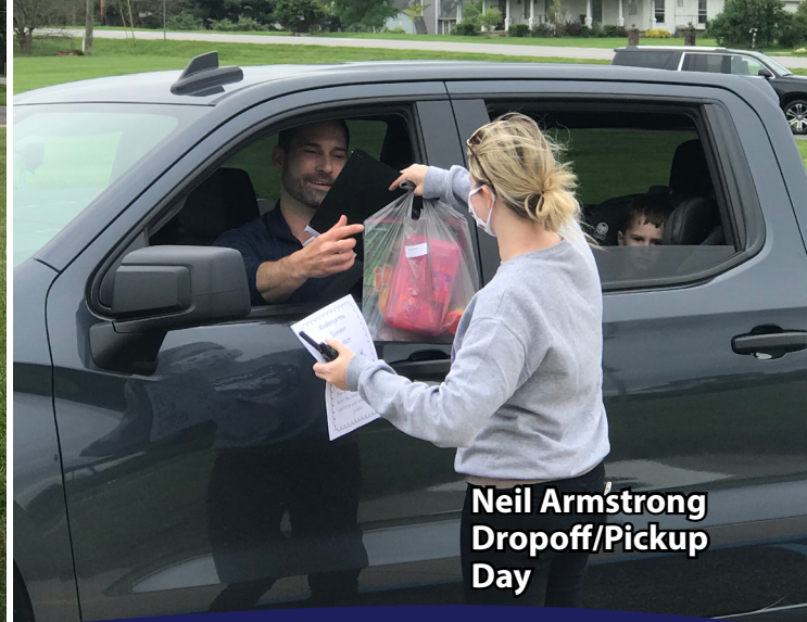
Neil Armstrong Dropoff/Pickup Day