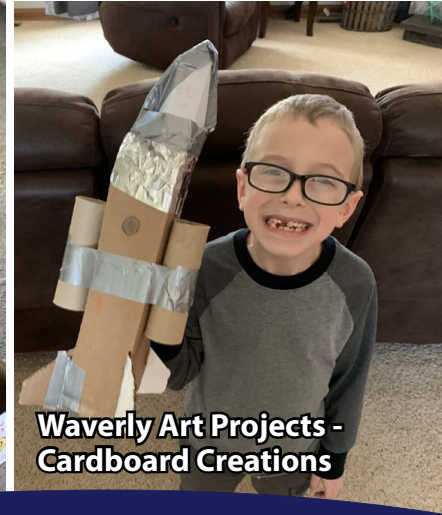
Waverly Art Projects - Cardboard Creations